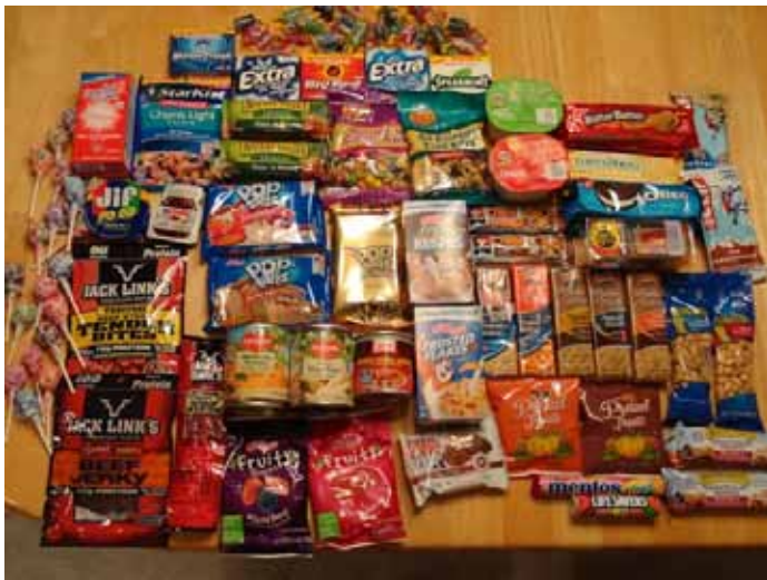
Vet Supplies! Goodies that would make a grizzled old gunny smile.